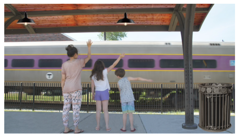
OPEN SPACE & RECREATION AREA