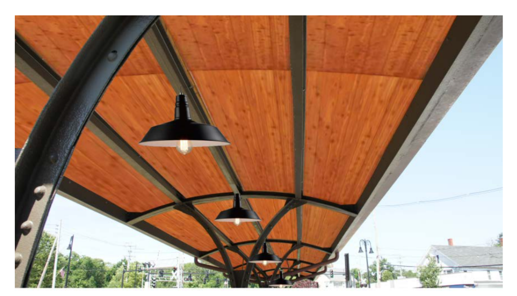
Artist rendition of the ceiling and lighting