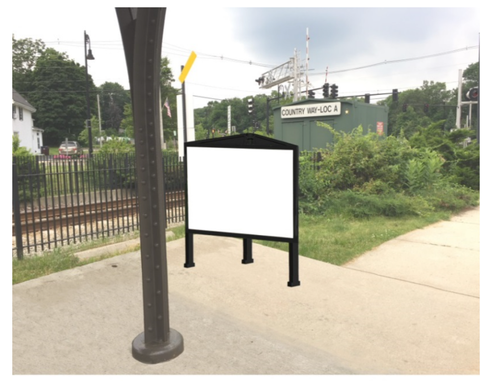
Proposed signage of North Scituate history