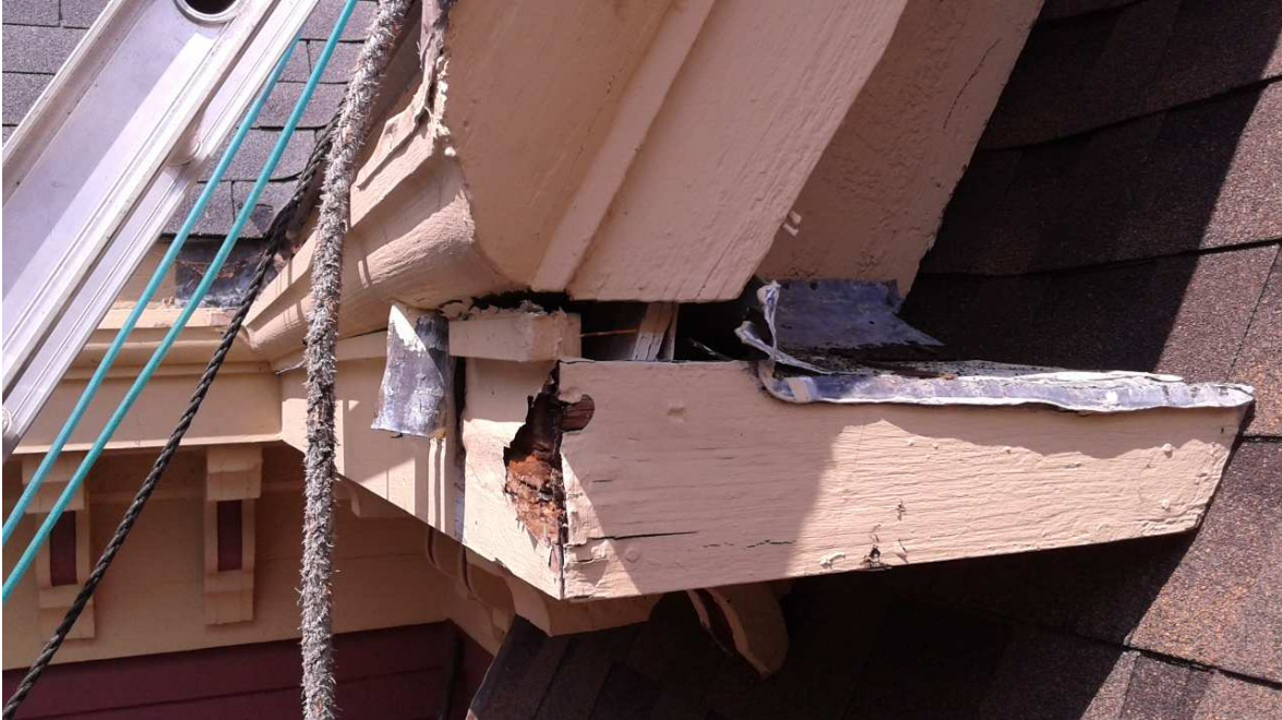
Deteriorated cornice and fascia boards to be replace at a later date Phase II and other areas with similar issues