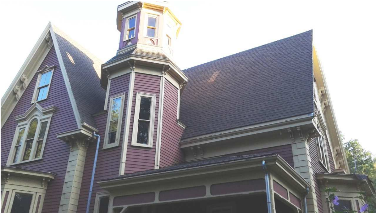
North roof (shingles completed, gutter replacement not complete)