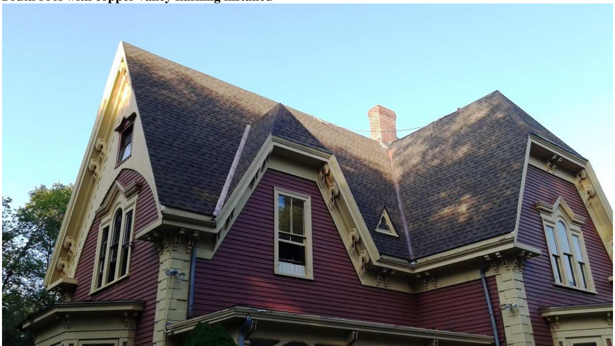
Southeast roof with copper valley flashings installed