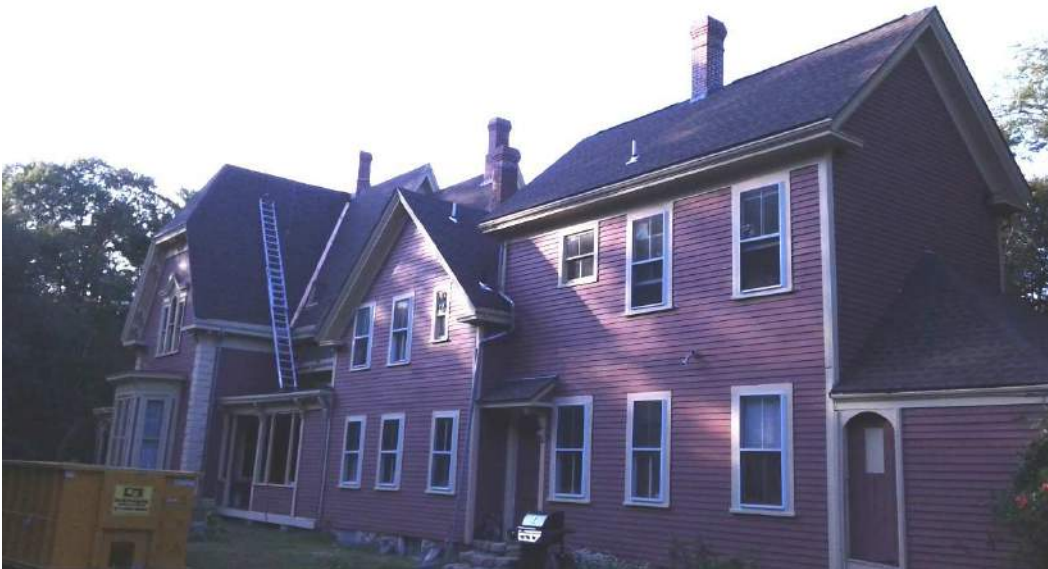
South view looking west

Note: Contractor issued credit of $720. .