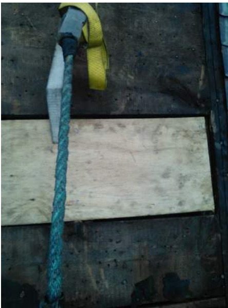
Replaced sheathing done by roofer