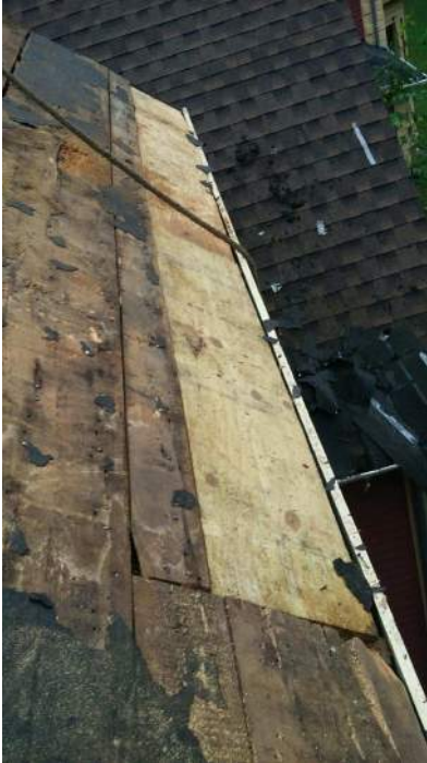
Replaced sheathing done by roofer