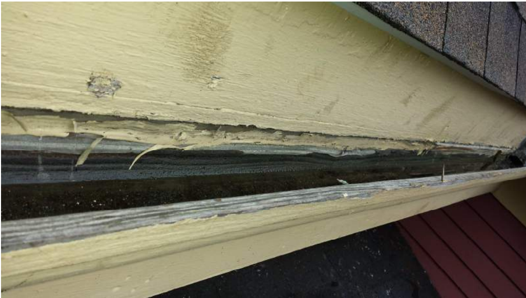
Sealant on original wood gutters in need of replacement Phase III