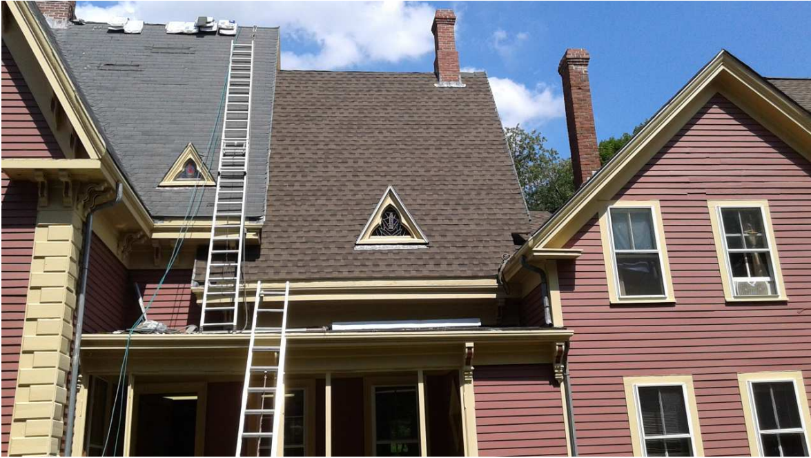
South roof Phase II and other areas with similar issues