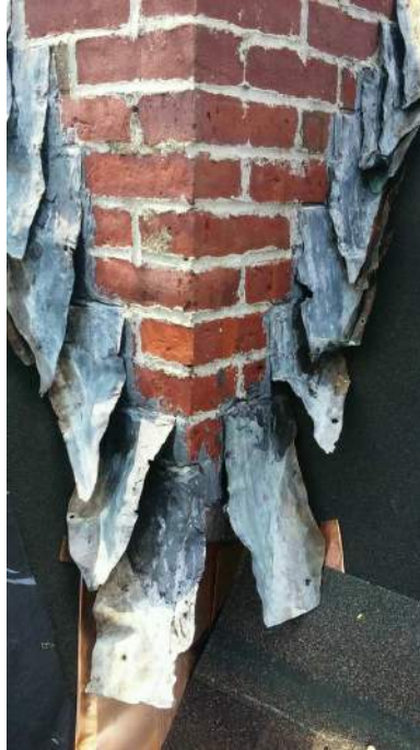
lead-coated copper in need of replacement done by roofer