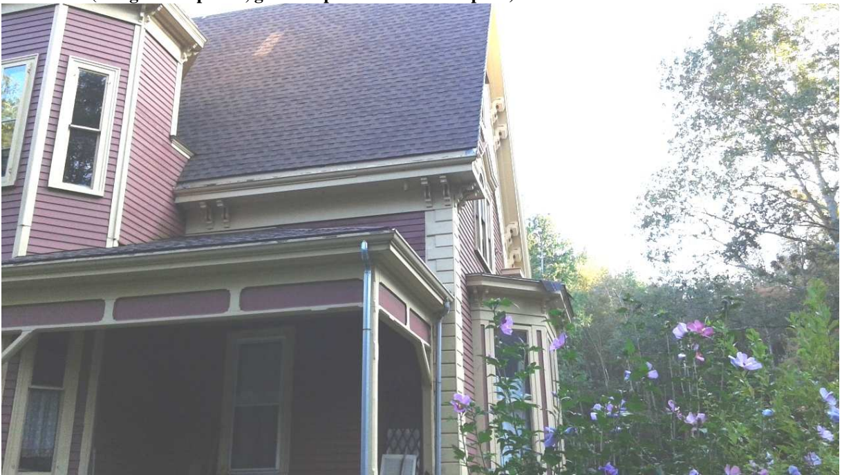
Northeast porch roof