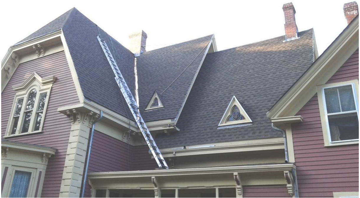
South roof with copper valley flashing installed