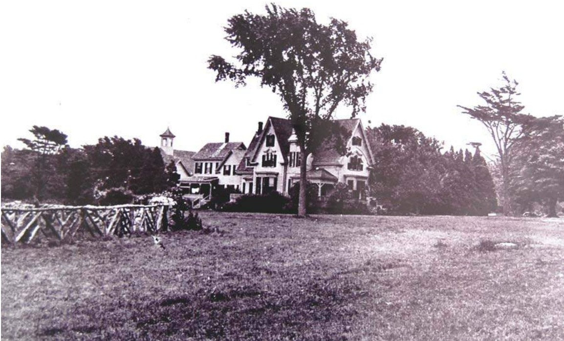
Ellis House, North View late 1800's to early 1900.