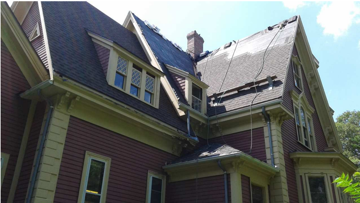
Northeast roof Phase I