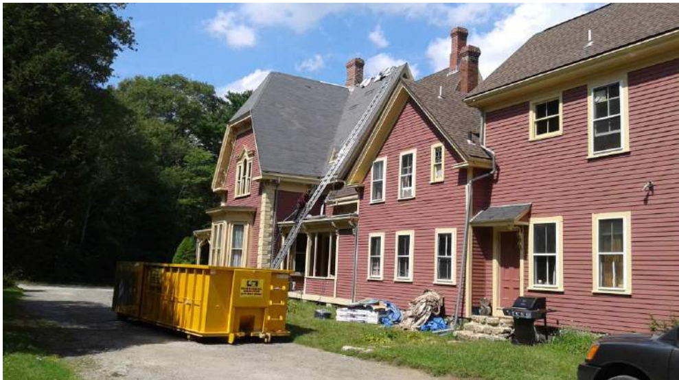
South view looking west