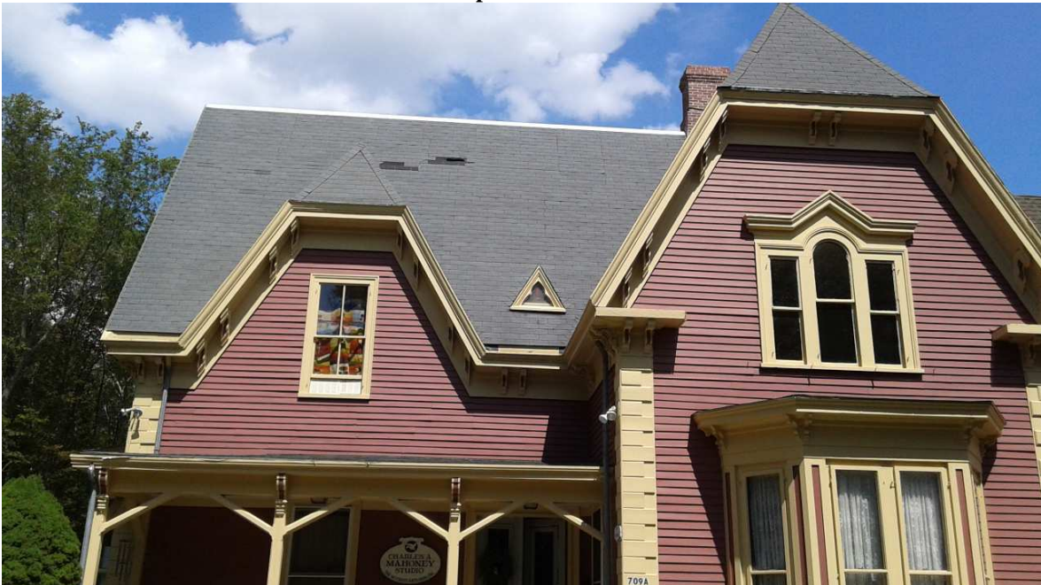
Southwest roof (existing shingles as of 8/26) Phase IV returns in larger peak; Phase III, southwest corner needs sealing at gable corner; unpainted clapboards replaced during work on porch roof.