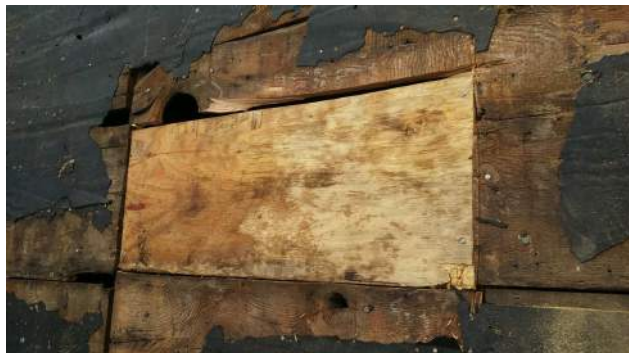
Replaced sheathing done by roofer