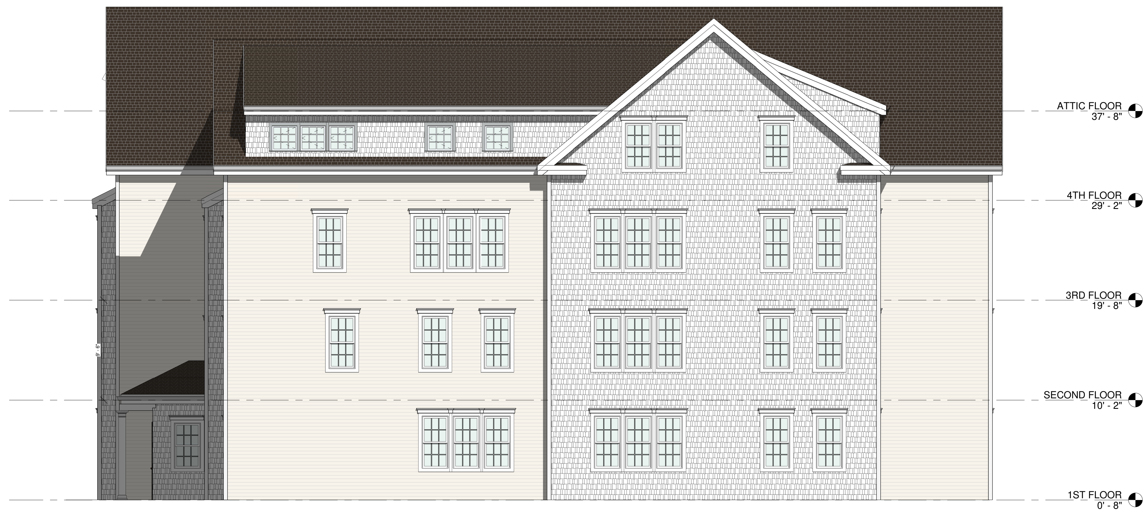
④ EAST ELEVATION 3/16" = 1'-0"

AXIOM ARCHITECTS AXIOM ARCHITECTS 2048 WASHINGTON STREET HANOVER, MASSACHUSETTS 02339 (781) 871-2101 (781) 871-7509