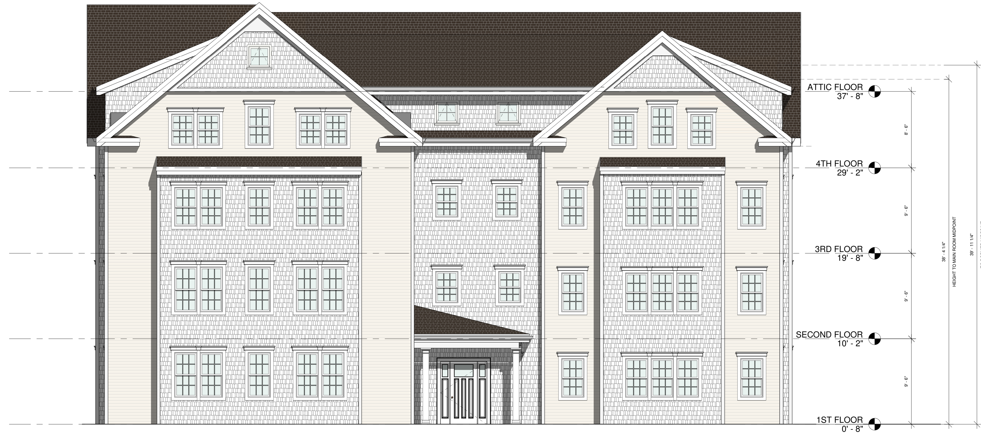
① FRONT ELEVATION 3/16" = 1'-0"

BUILDING HEIGHT REQUIREMENT REFERENCE TOTAL BUILDING HEIGHT: REQUIREMENT - MAXIMUM 4 STORY, 40' - 0" PROPOSED - 4 STORY, 38' - 4" TO ROOF MIDPOINT