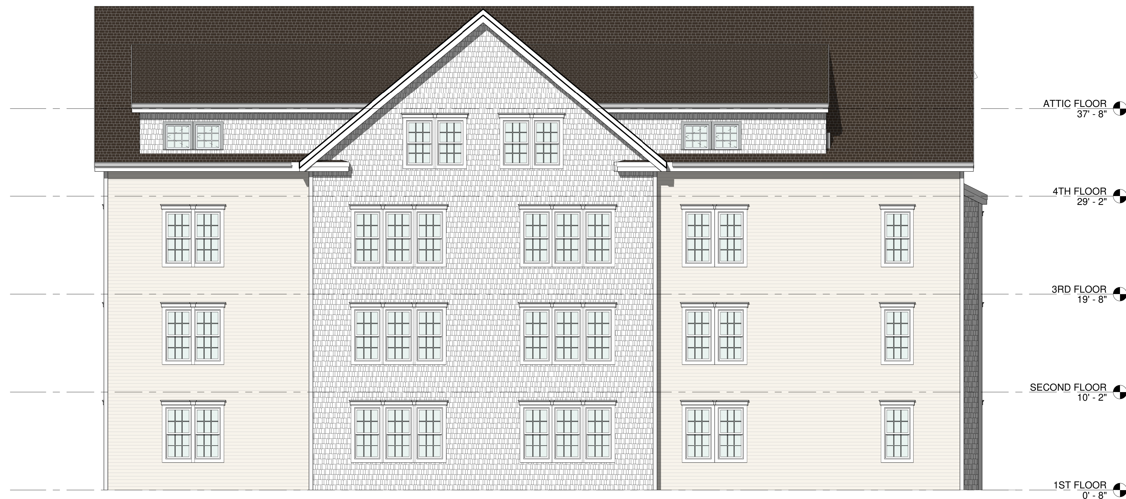
② WEST ELEVATION 3/16" = 1'-0"