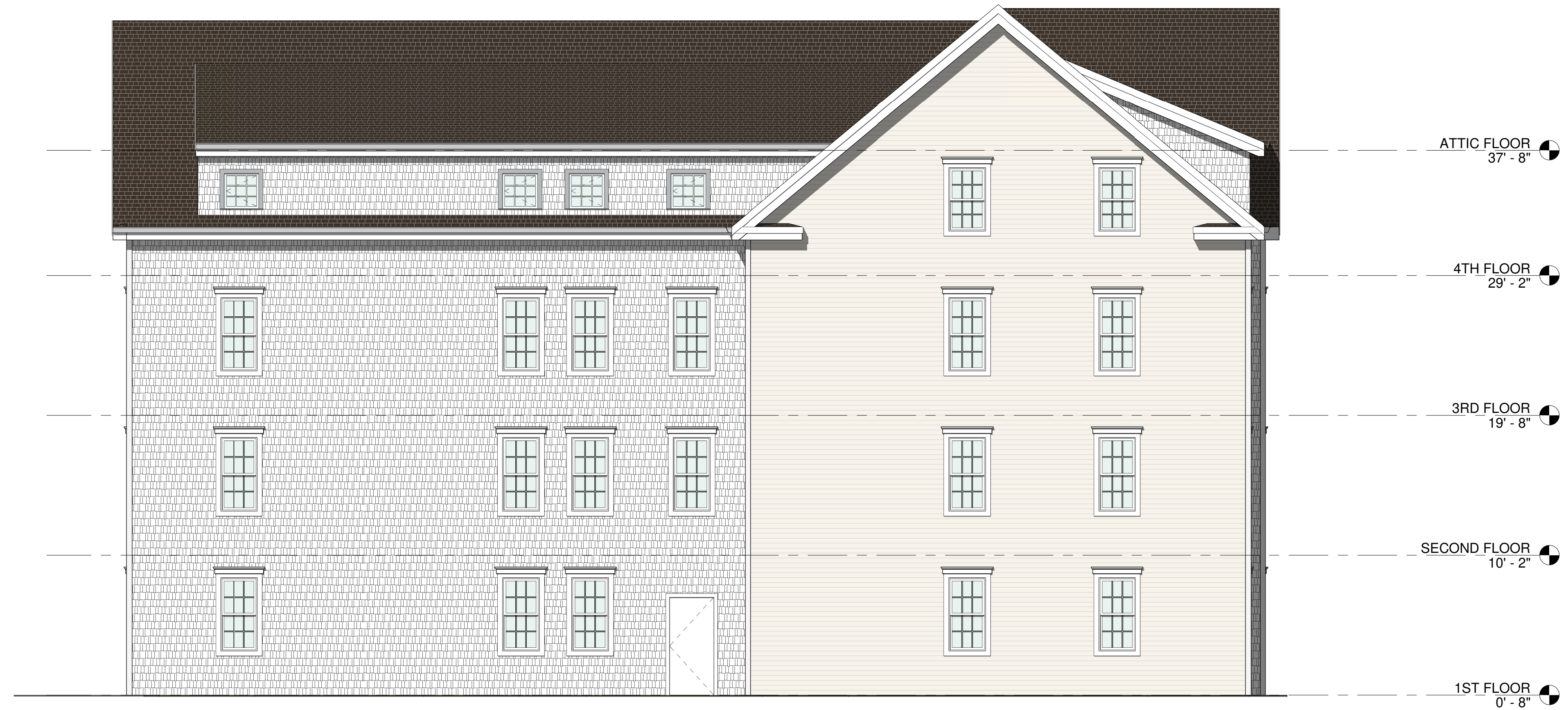
① REAR ELEVATION 3/16" = 1'-0"