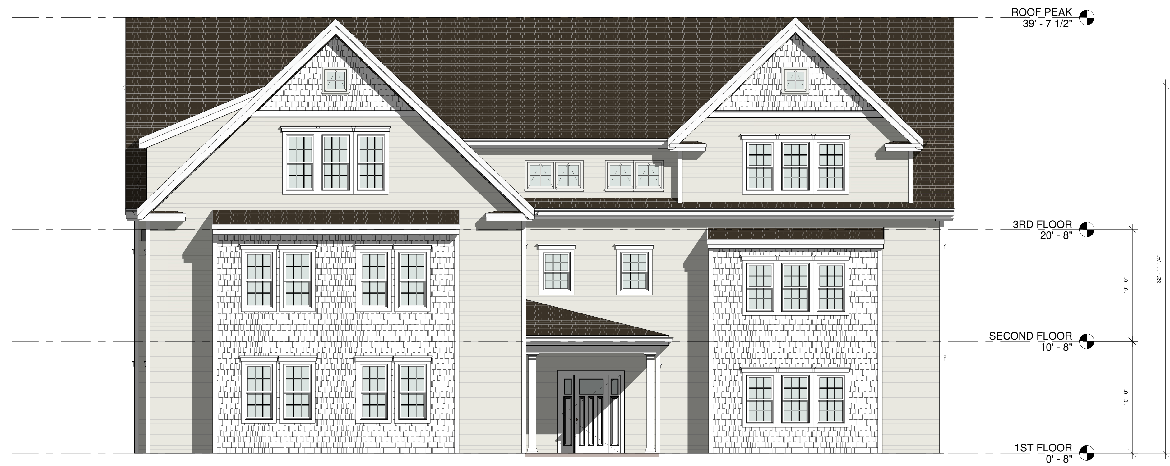
1 FRONT ELEVATION 3/16" = 1'-0"

BUILDING HEIGHT REQUIREMENT REFERENCE TOTAL BUILDING HEIGHT: REQUIREMENT - MAXIMUM 4 STORY, 40' - 0" PROPOSED - 4 STORY, 32' - 11" TO ROOF MIDPOINT