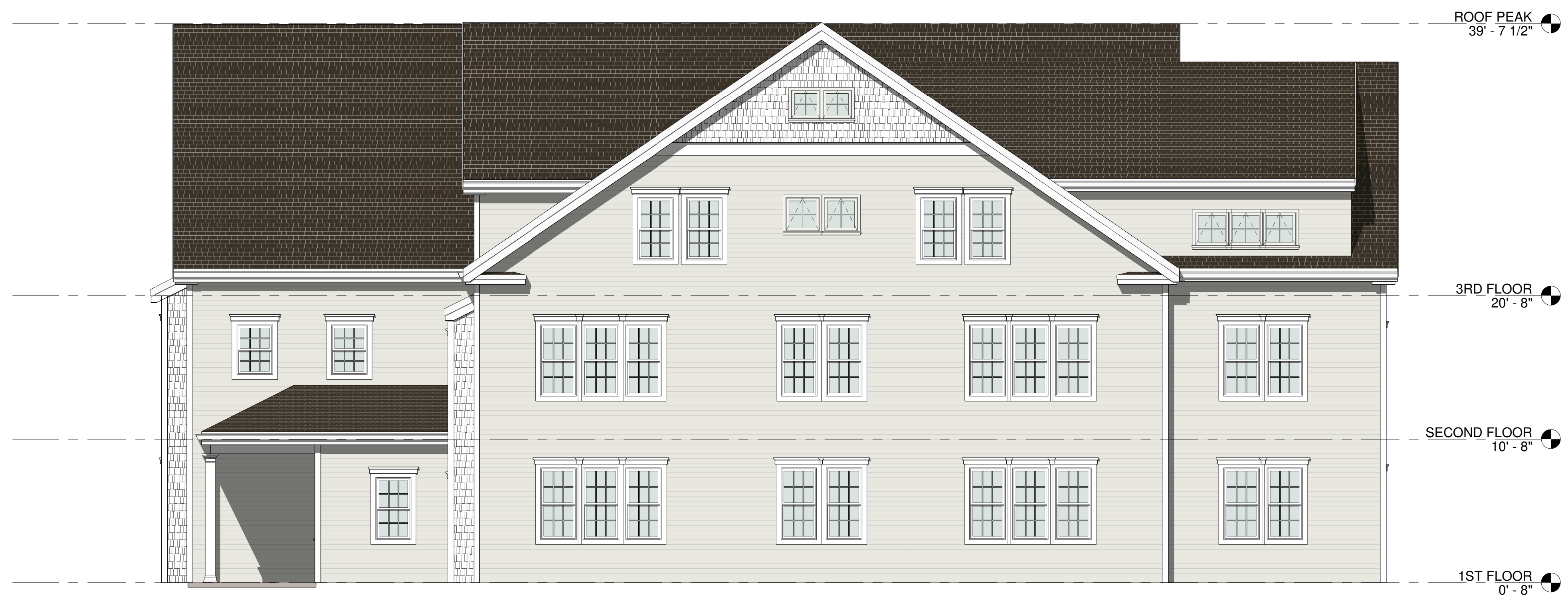
4 EAST ELEVATION 3/16" = 1'-0"