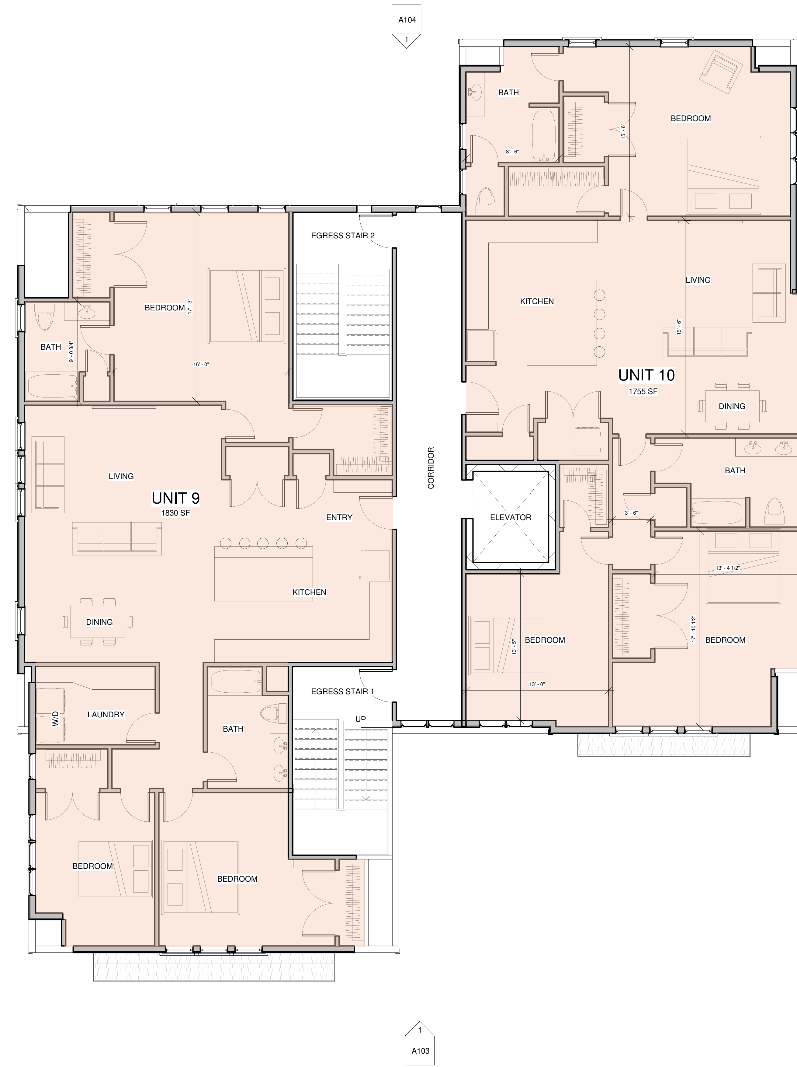
1 3RD FLOOR 3/16" = 1'-0"