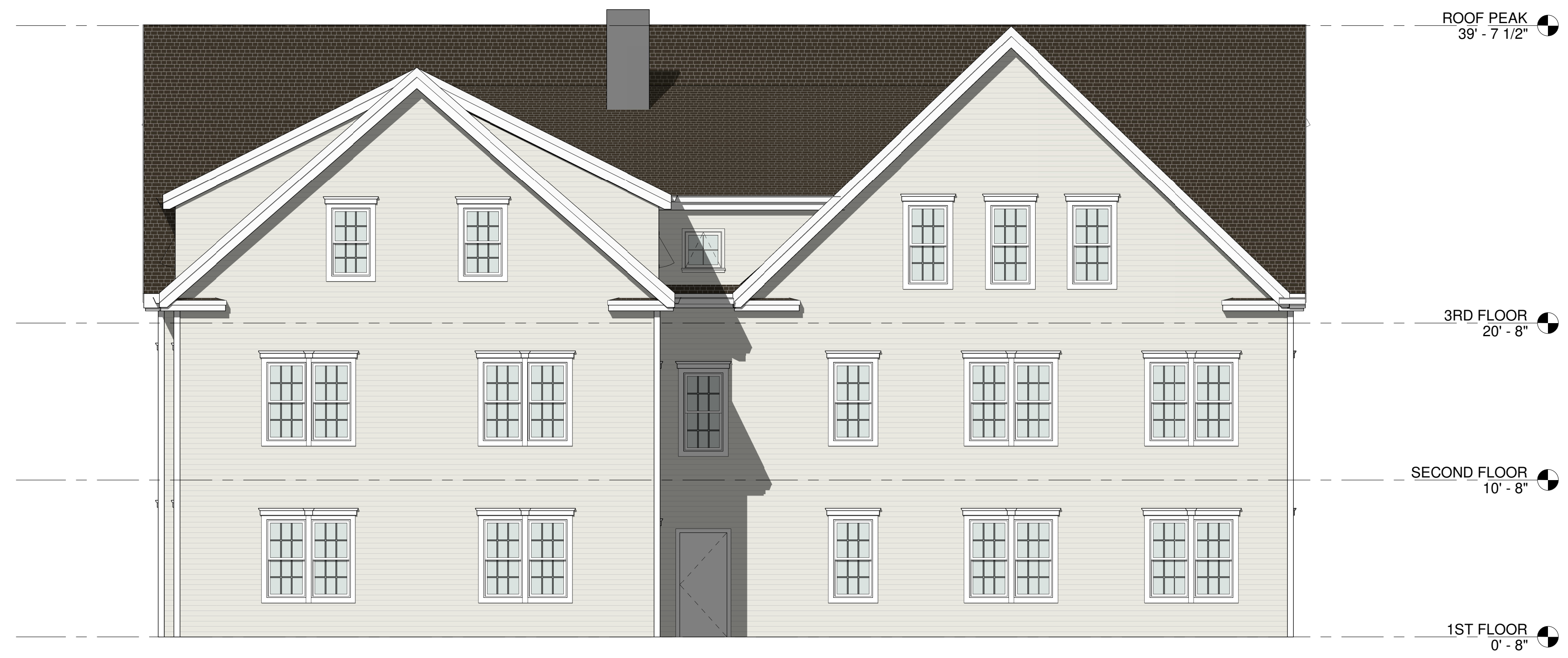
① REAR ELEVATION 3/16" = 1'-0"