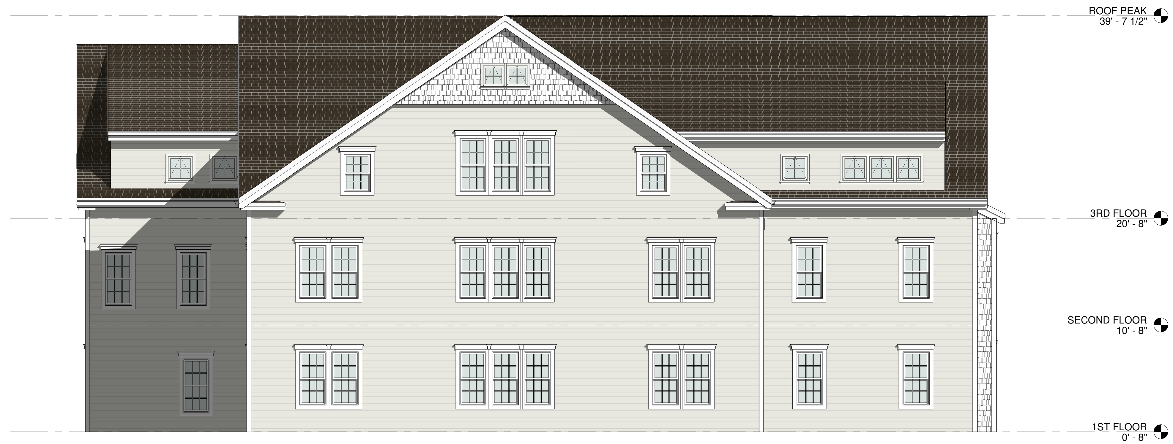
② WEST ELEVATION 3/16" = 1'-0"