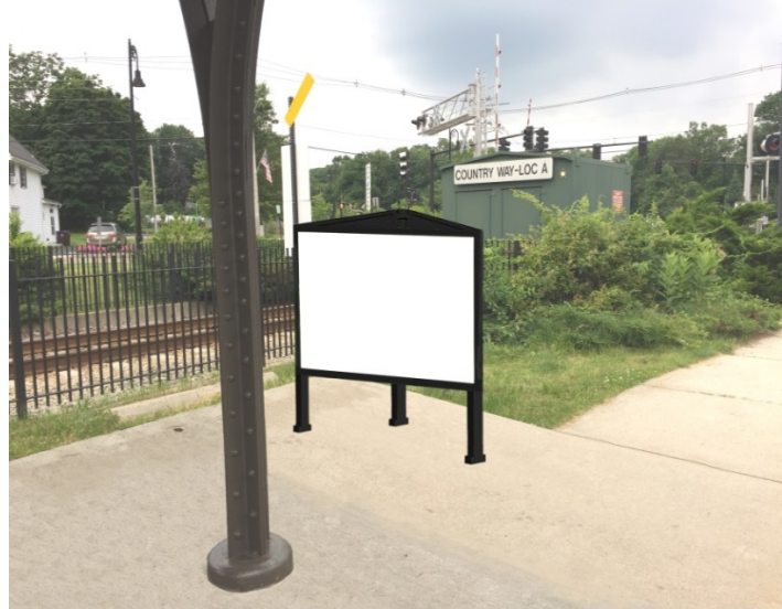
Proposed signage of North Scituate history

Signage 1: 1871 History of North Scituate Train Station