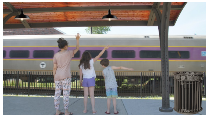
OPEN SPACE & RECREATION AREA