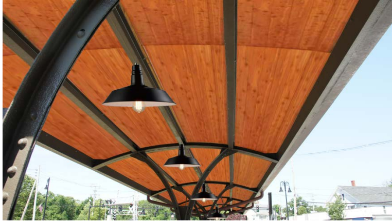
Artist rendition of the ceiling and lighting