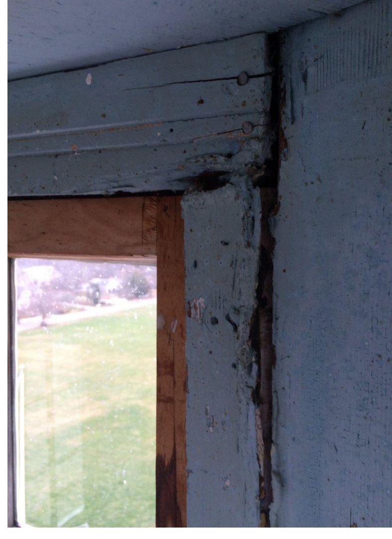
CPA – Support of Community Housing

Community Preservation Act MGL Chapter 44B – As amended 2012 by c. 103, 69-83 and c. 503 of the Acts of 2014