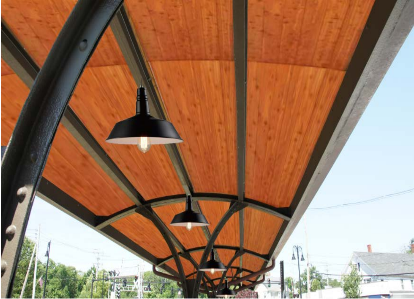
Artist rendition of the ceiling and lighting