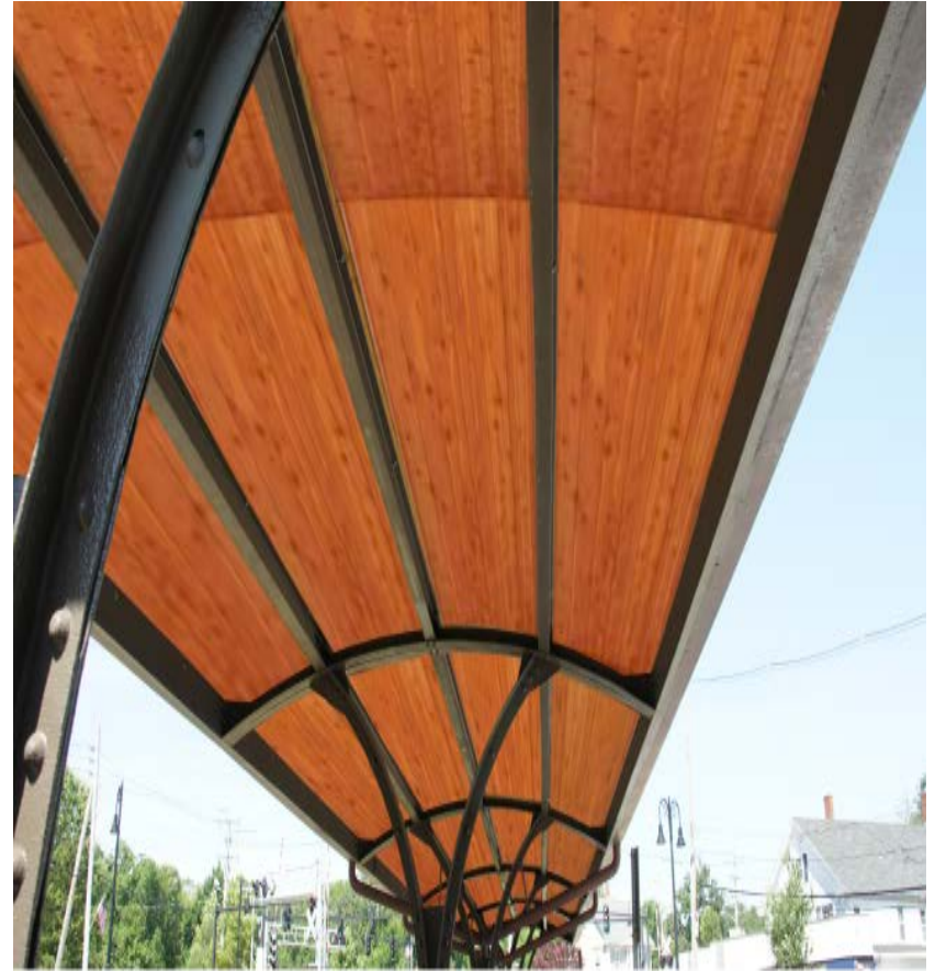
Artist rendition of the ceiling