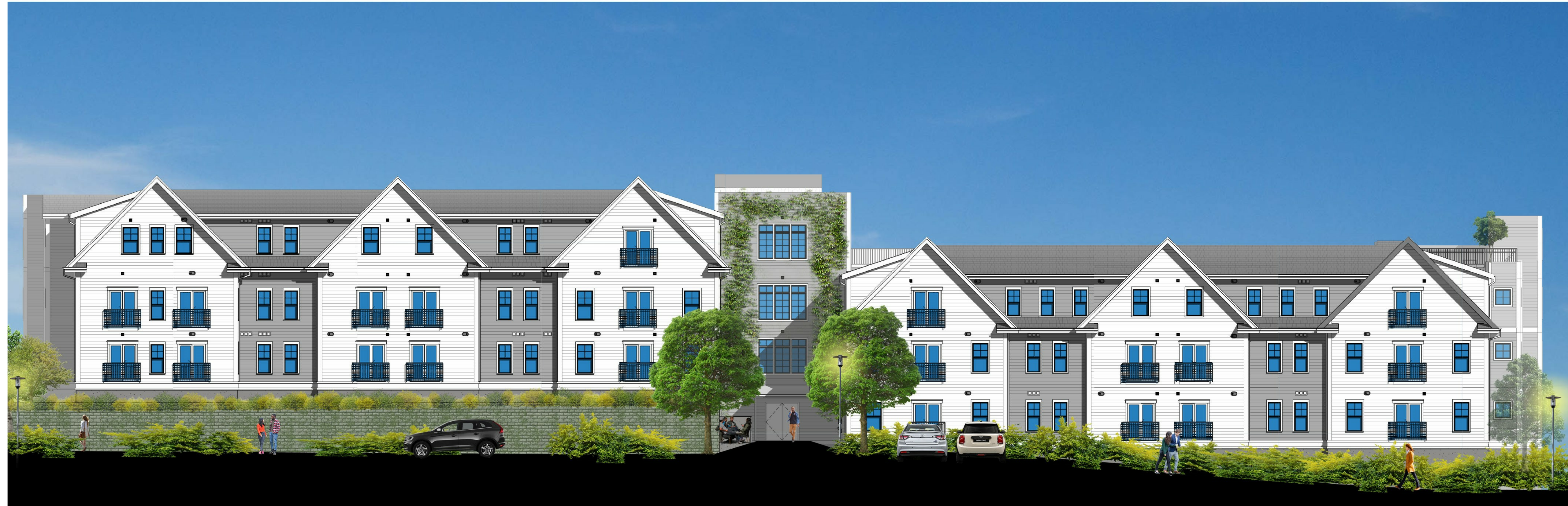
Cube 3 Current Elevation - 09/30/2020