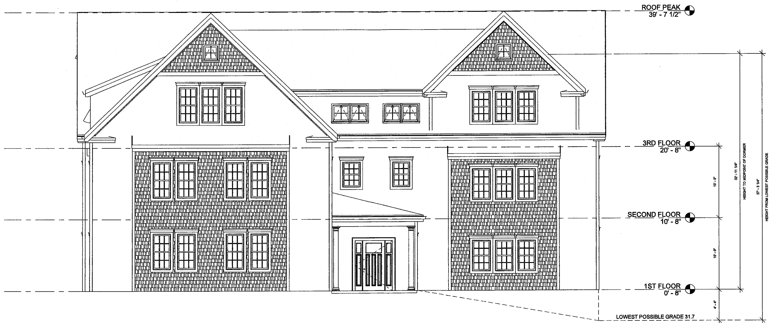
BUILDING 2 - SUPPLEMENTAL HEIGHT INFORMATION