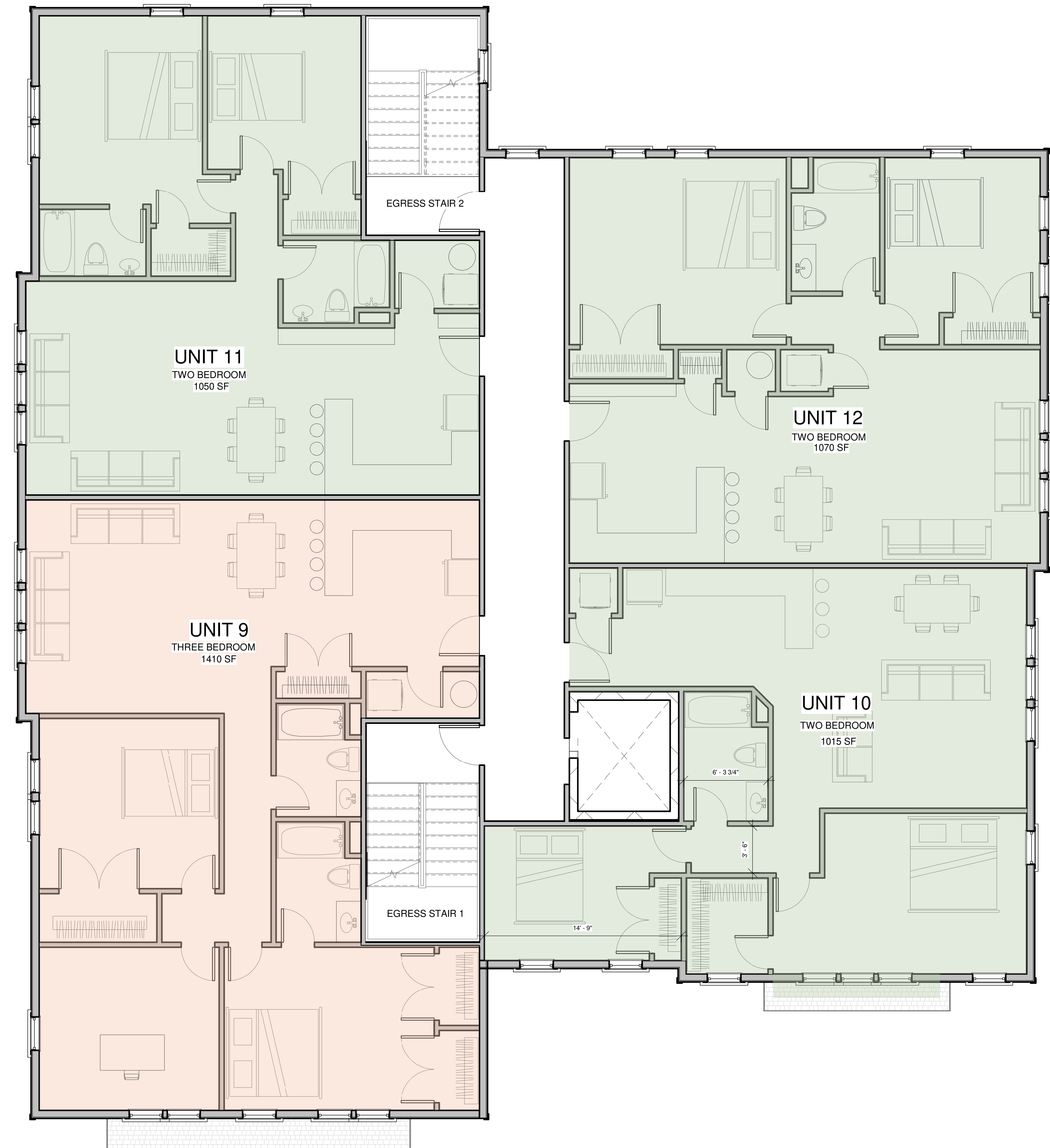
① 3RD FLOOR 3/16" = 1'-0"