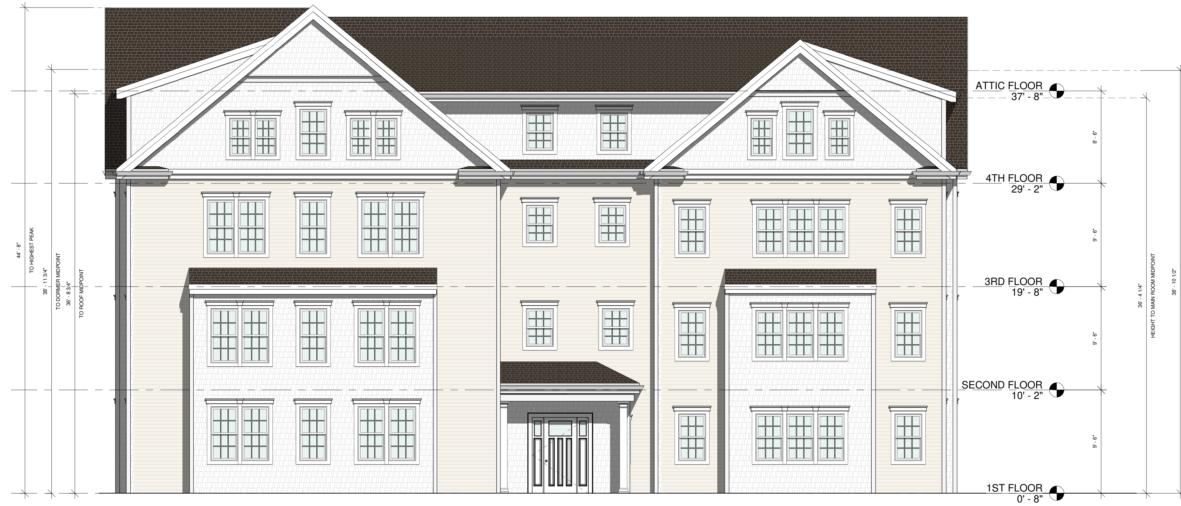
① FRONT ELEVATION 3/16" = 1'-0"

BUILDING HEIGHT REQUIREMENT REFERENCE TOTAL BUILDING HEIGHT: REQUIREMENT - MAXIMUM 4 STORY, 40' - 0" PROPOSED - 4 STORY, 36' - 9" TO ROOF MIDPOINT