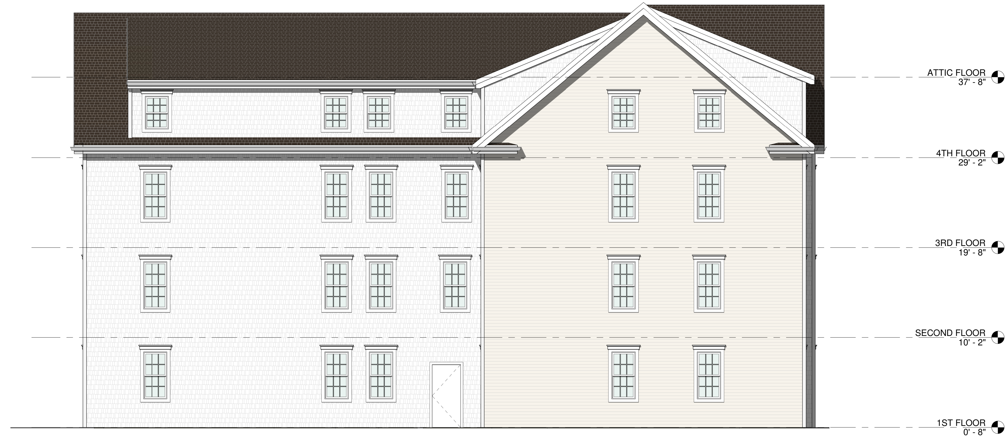
① REAR ELEVATION 3/16" = 1'-0"