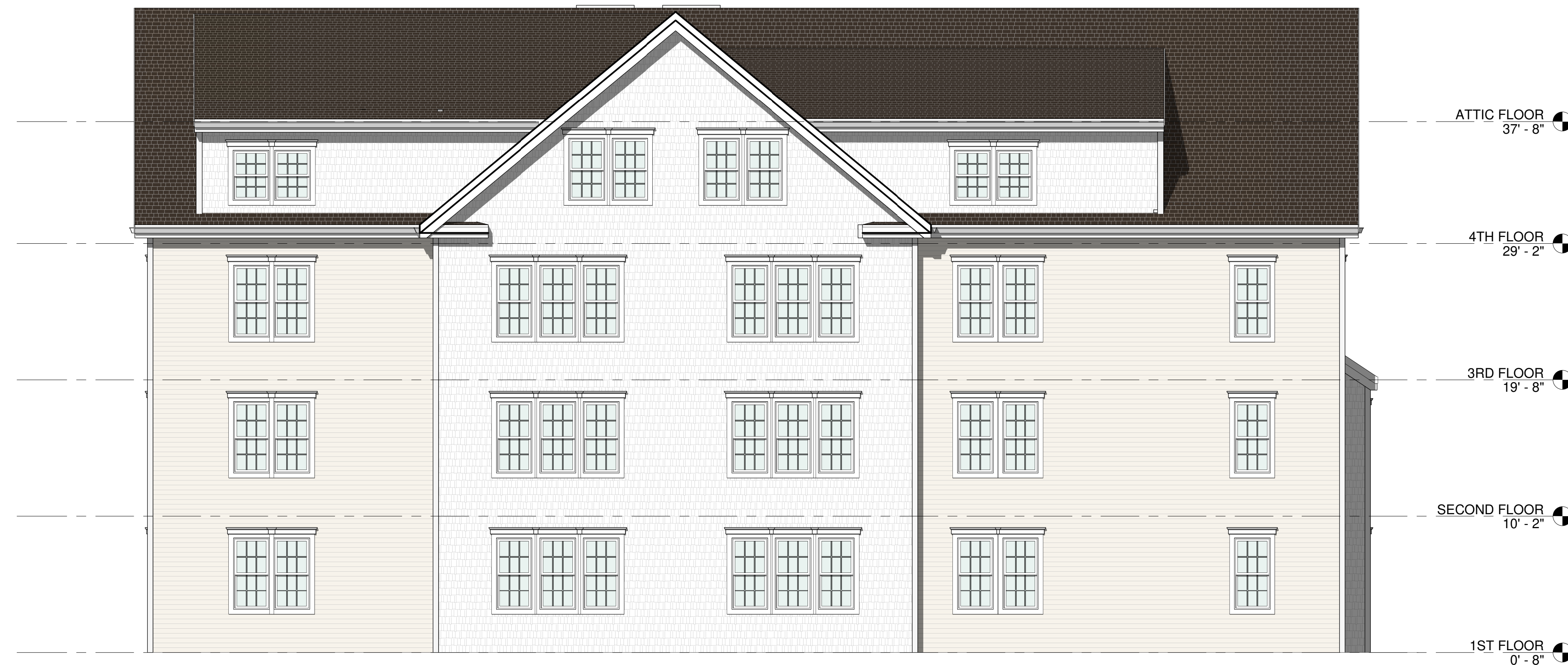
② WEST ELEVATION 3/16" = 1'-0"