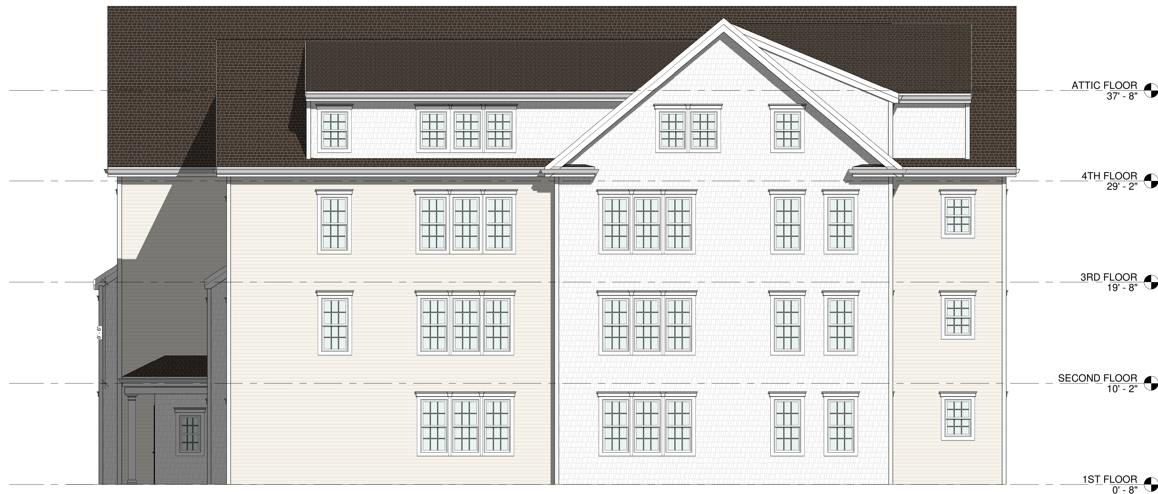
④ EAST ELEVATION 3/16" = 1'-0"