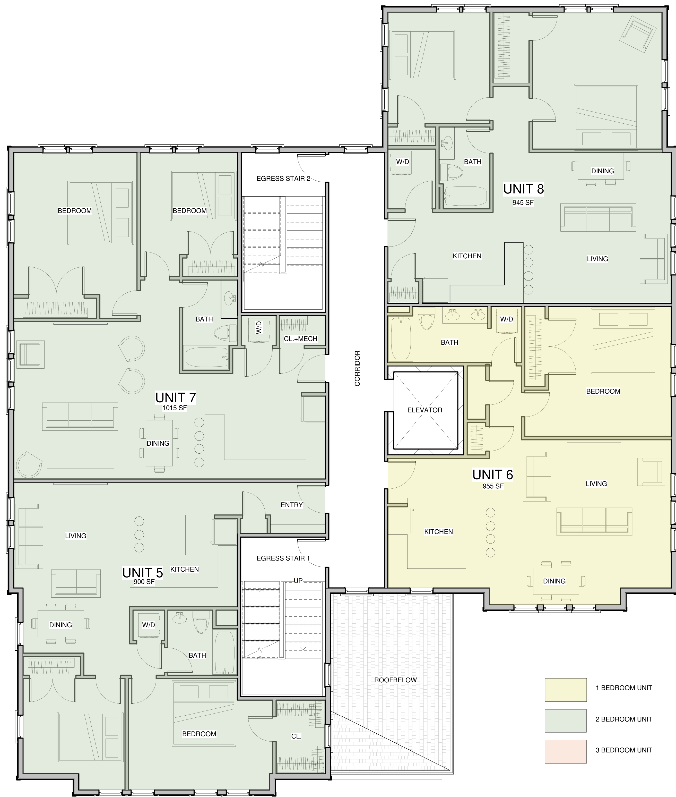
② SECOND FLOOR 3/16" = 1'-0"