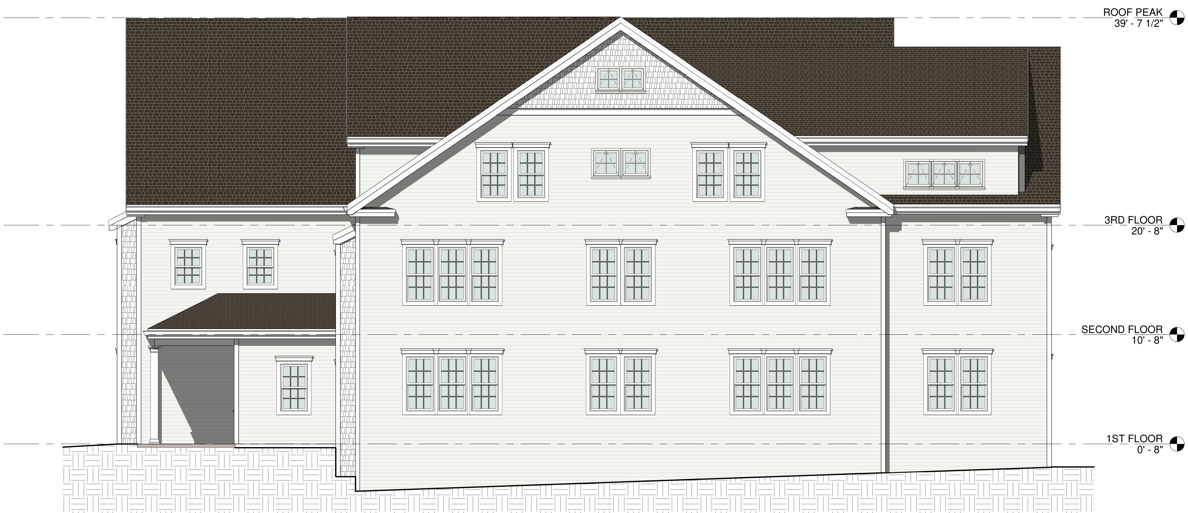
④ EAST ELEVATION 3/16" = 1'-0"