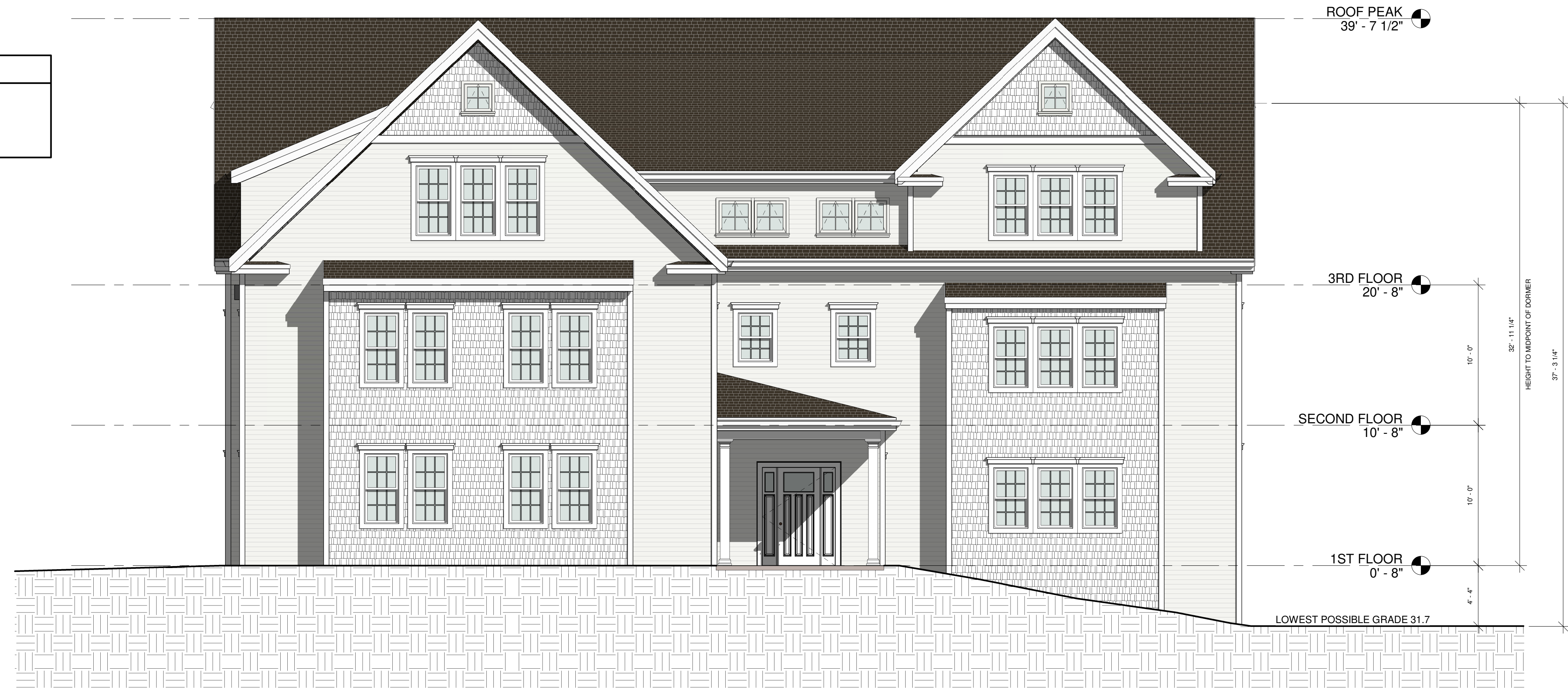
① FRONT ELEVATION 3/16" = 1'-0"

BUILDING HEIGHT REQUIREMENT REFERENCE TOTAL BUILDING HEIGHT: REQUIREMENT - MAXIMUM 4 STORY, 40' - 0" PROPOSED - 3 STORY, 32' - 11" TO ROOF MIDPOINT