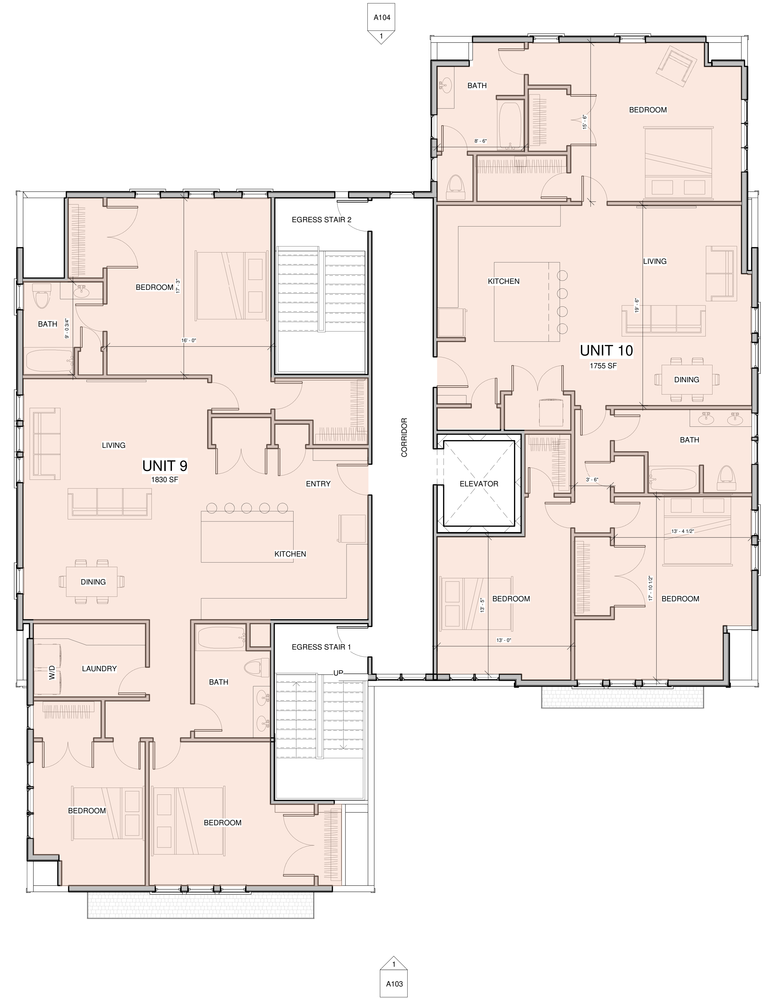
1 3RD FLOOR 3/16" = 1'-0"