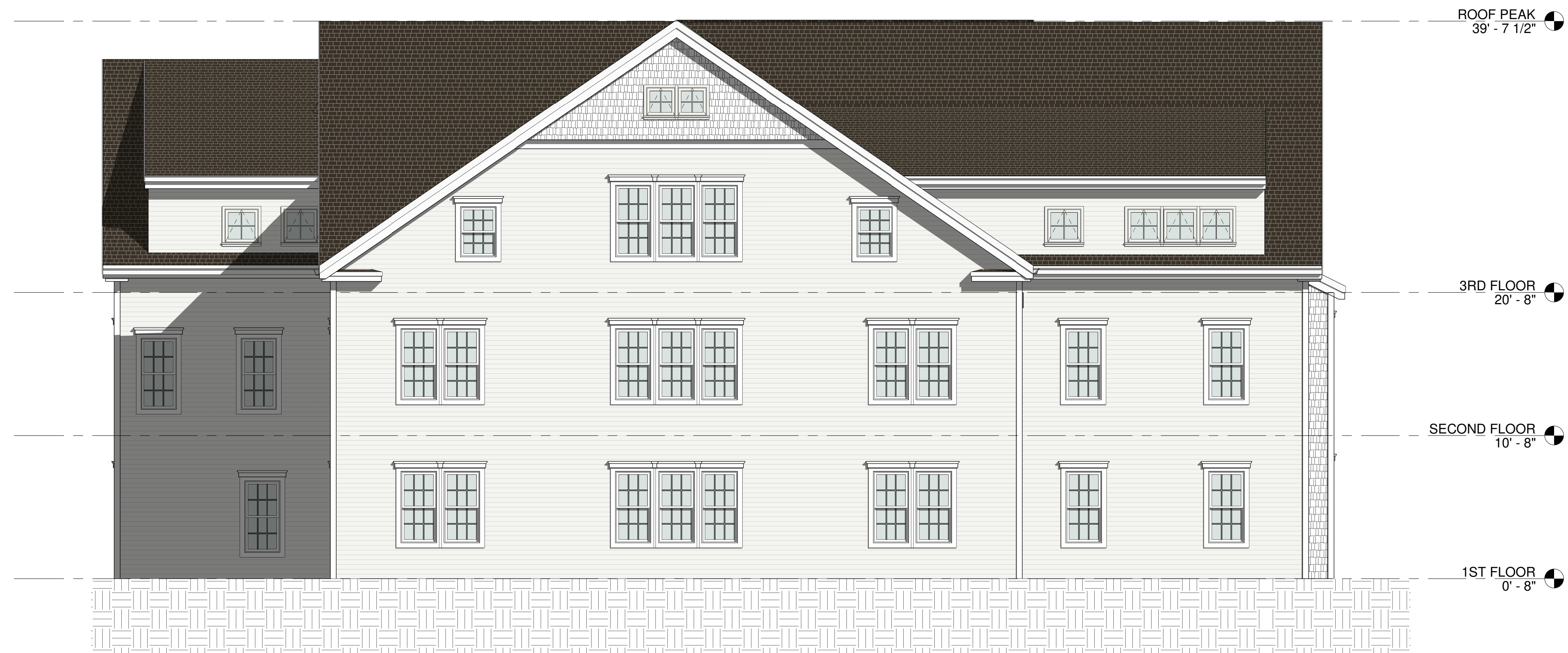
② WEST ELEVATION 3/16" = 1'-0"