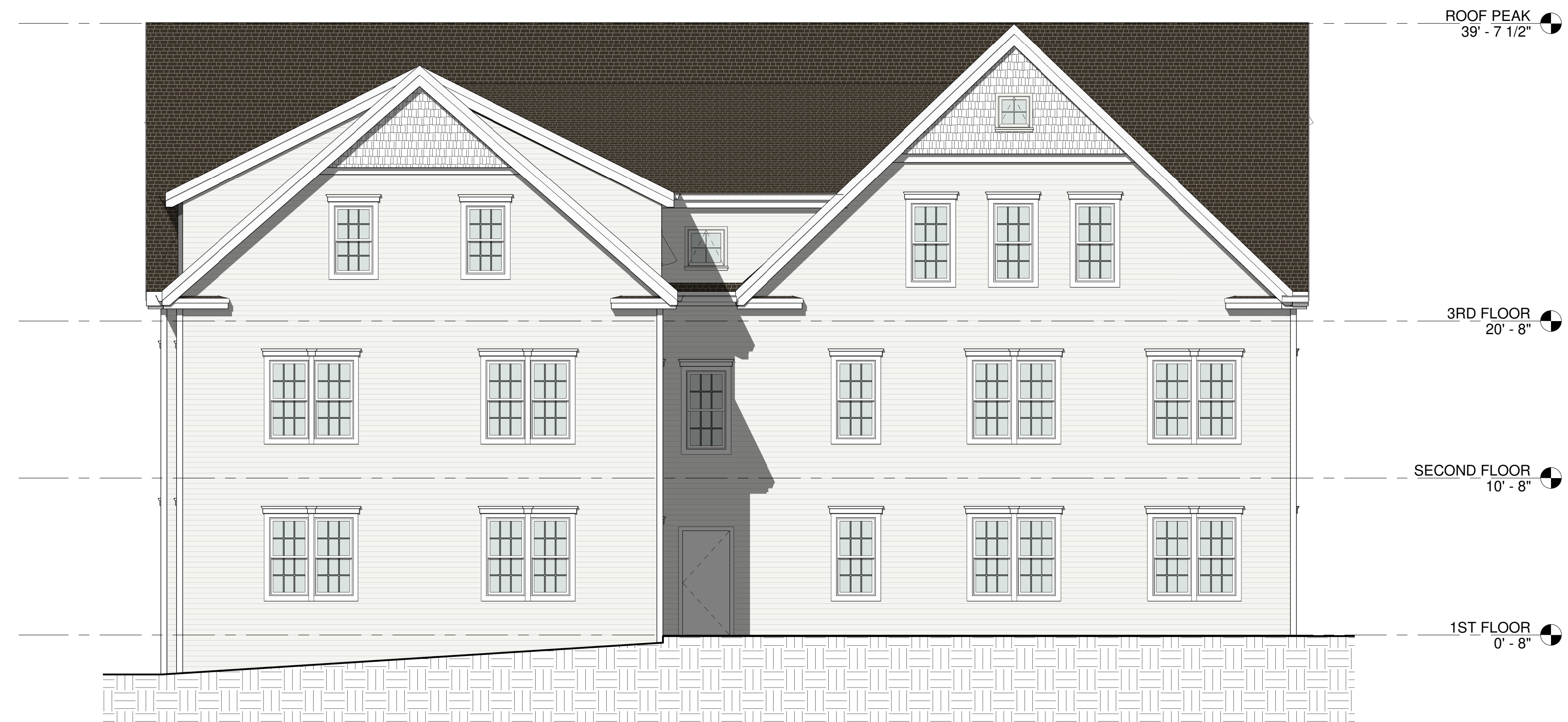
① REAR ELEVATION 3/16" = 1'-0"