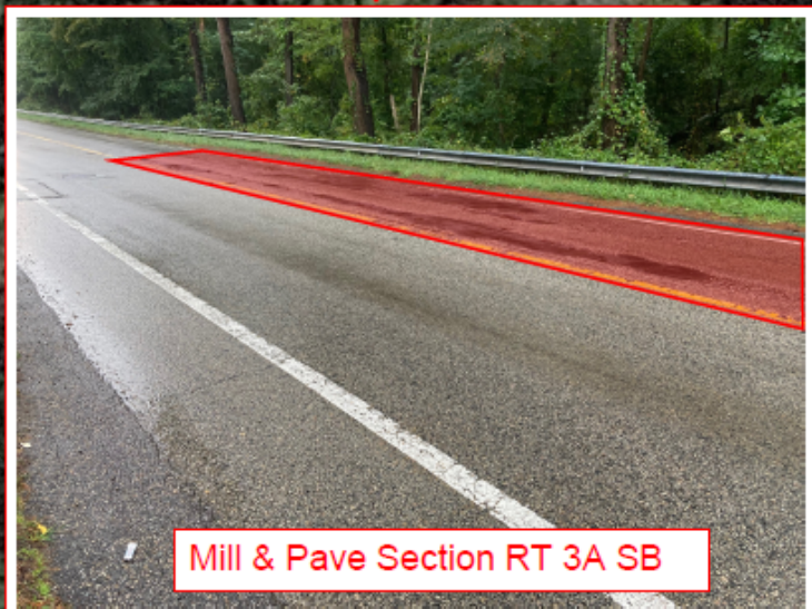
Mill & Pave Section RT 3A SB

Paving Limits: 13' x 100' patch Across from #666 RT 3A AREA: 1,300 SF DIMENSIONS: WIDTH: 13' LENGTH: 100'